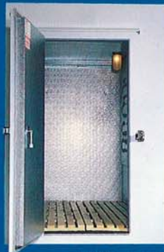
Coil Plate Interior (4 x 8 Shown)