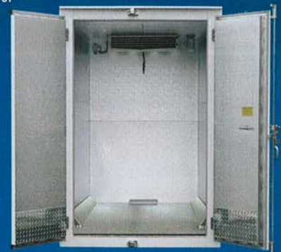
Auto Defrost Interior (5 x 9 Shown)