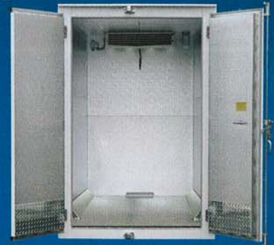
Auto Defrost Interior (5 x 9 Shown)